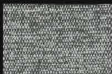
ROCCO -46- lava rock