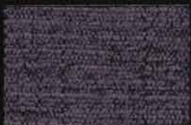
ROCCO -31- nightshade