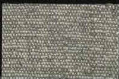
ROCCO -40- bark