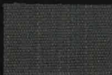
ROCCO -52- hurricane