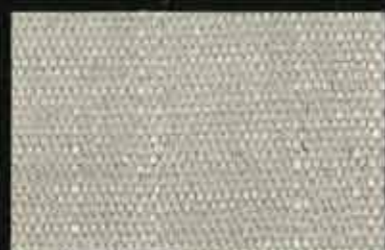
ROCCO -41- buff