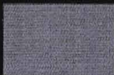
ROCCO -32- wood violet