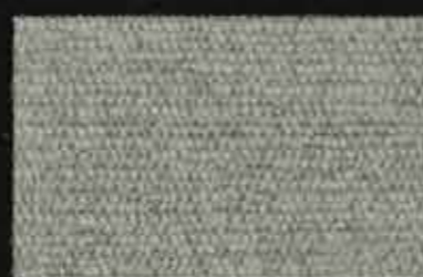
ROCCO -42- umber