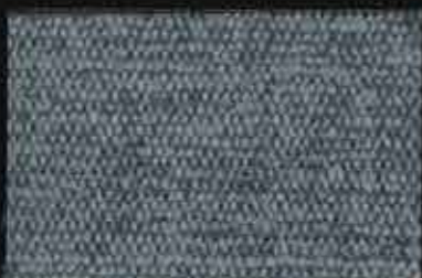
ROCCO -48- lead