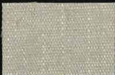
ROCCO -11- clay