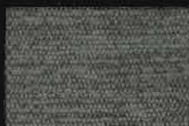
ROCCO -45- charcoal