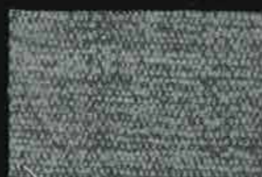
ROCCO -47- gunmetal