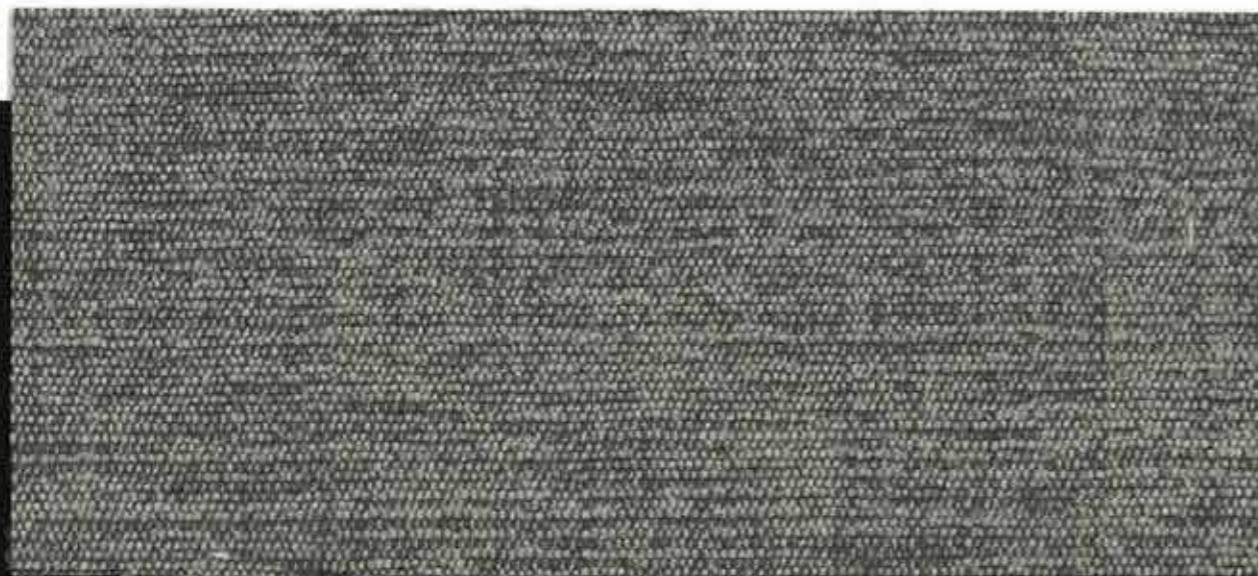
ROCCO -43- mercury