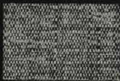
ROCCO -44- liquorice