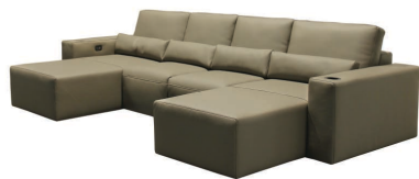
MOTORIZED SEATS & CHAISES