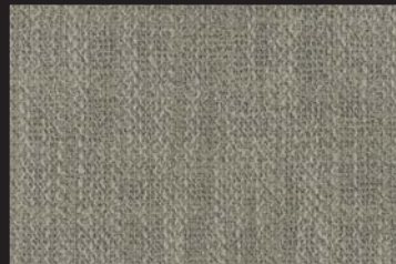
17278 - 5 grise sage