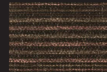
17279 - 07 chocolat lyriq