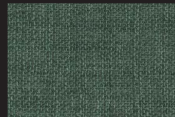
17278 - 14 vert