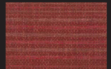
17279 - 06 vie en rouge