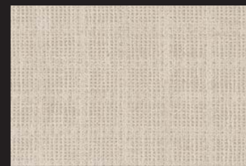
17278 - 3 naturelle