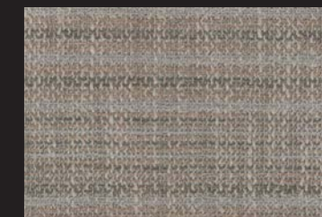
17279 - 04 grise vintage