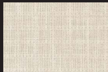
17278 - 2 presque blanc