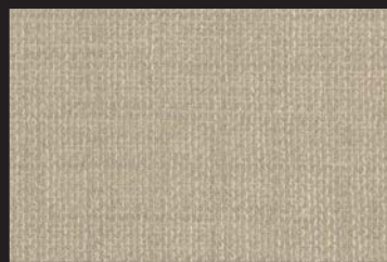
17278 - 4 sable