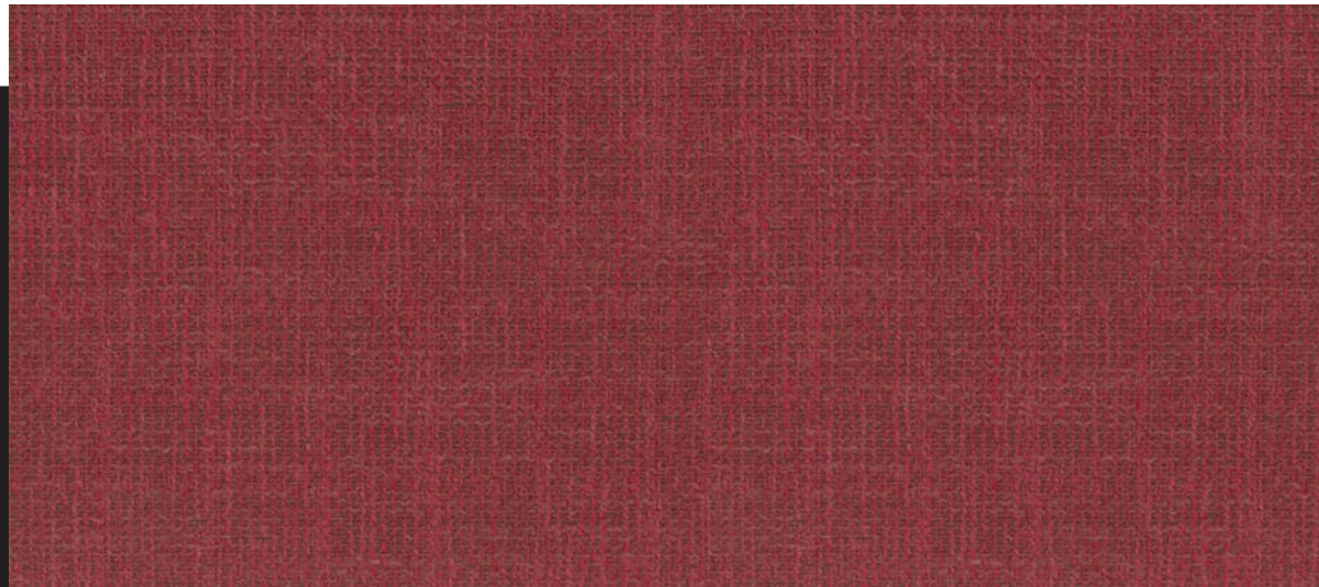
17278 - 12 rouge