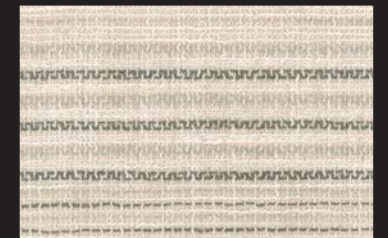
17279 - 01 blanc