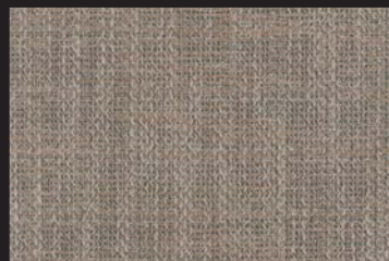
17278 - 10 taupe gris