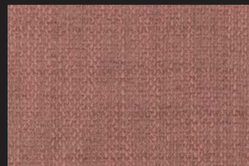
17278 - 13 rose