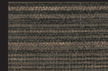
17279 - 05 taupe gris