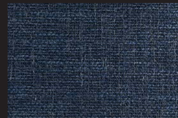
17278 - 8 blue de la mer