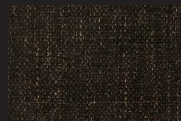
17278 - 16 chocolat