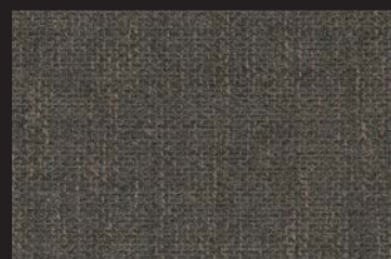
17278 - 15 tourterelle