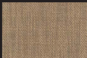
17278 - 11 camel