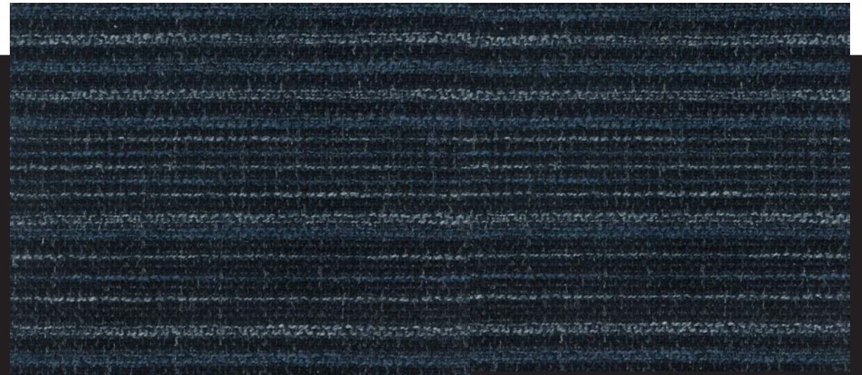
17279 - 08 blue intrigant