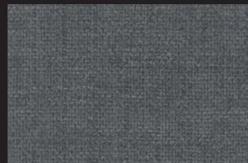
17278 - 7 cloud blue