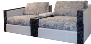
LOW & HIGH ARMRESTS