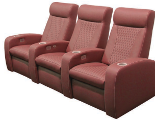
NERO INCLINER + DIAMOND STITCH