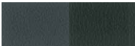
25704 misty blue LT421019