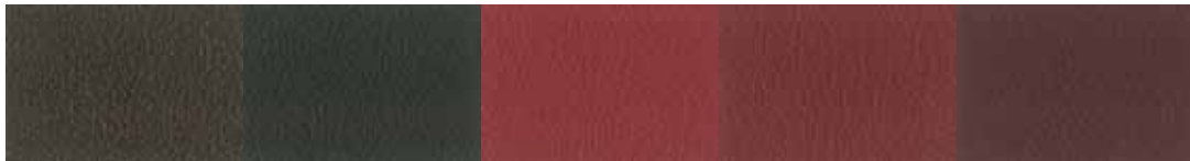
72763 mocha LT421055