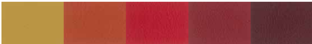
49058 pharaoh LT602070