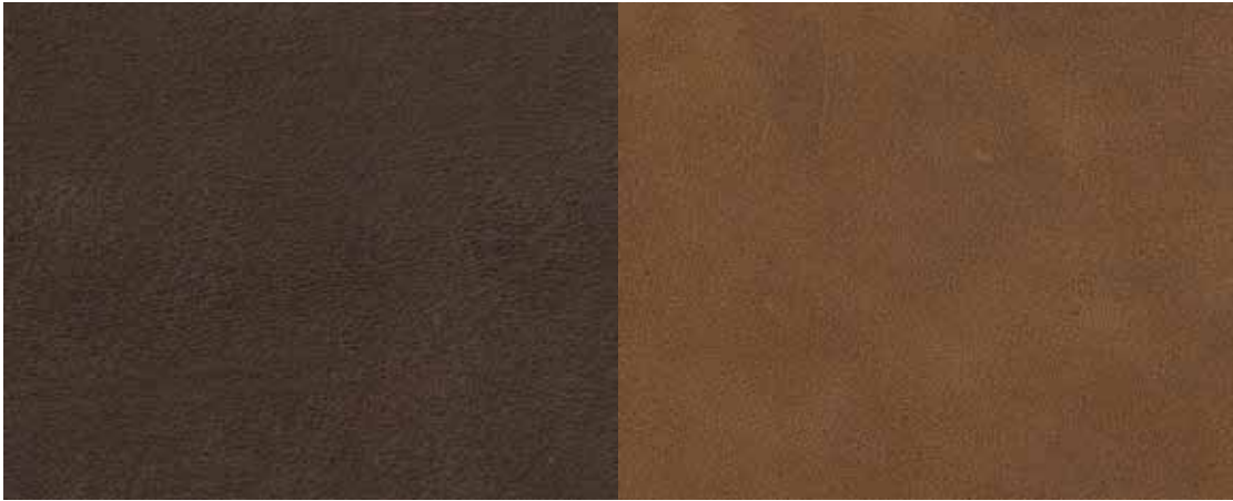
sienna - 79361