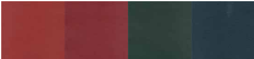
siegelstein - 16 LT080035