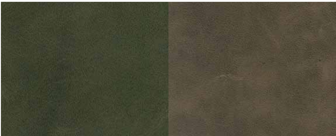
olive - 39380